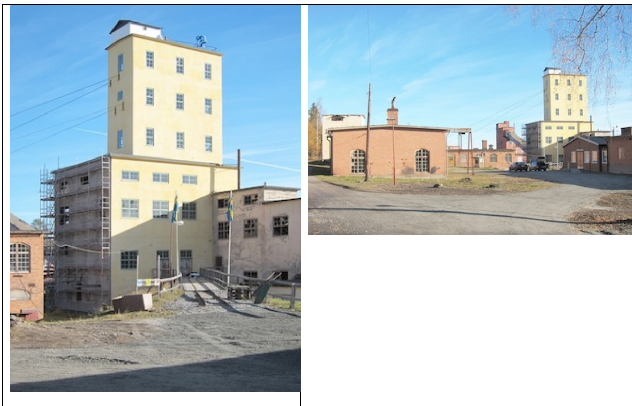
Photo 2: Stripa iron ore mine (image IMG_1544 Stripa foto Kri or IMG_1539 Stripa foto Kri)

Cement and concrete are often important buildings materials in industrial heritage sites. The care and restoration of such constructions raise difficult questions, in a field of practice where knowledge has been incomplete. Restoration and maintenance work at the former iron ore mine of Stripa, awarded as the Industrial Heritage site of the year in 2010, has been extensive, not least in the hoisting tower. See also Ahlberg (2012). Bevara betongen . Photo: Kri Bennström 2010.