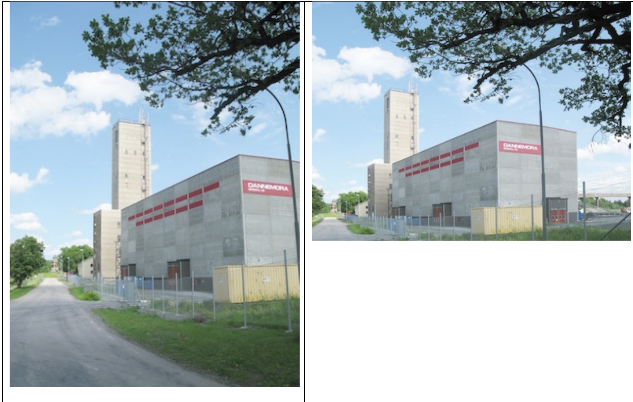
Photo 1: Dannemora (image IMG_9395 Dannemora kopia or IMG_9396 Dannemora kopia)

Mining in the more than 500 year old iron ore mine of Dannemora was closed down in 1992, as was mostly believed permanently. During the following years a number of buildings were protected from destruction and change, among them the hoisting tower in concrete built in 1956. In 2012 mining was started anew, after some years of preparation. As the hoisting tower was now needed again and a new concentration unit was needed the conditions for its protection were radically changed. In practice heritage interests are often sacrificed when facing productive/commercial interests.