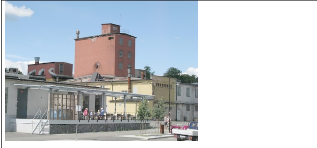
Photo 5. Hälleforsnäs foundry

an important part of a vibrant cultural and natural landscape. The dams represent a threat not only to the World Heritage site in itself but also to buildings and housing in Falun and they require continuous care and maintenance. The image shows Krondiksdammen, the biggest dam just above the copper mine. As numerous other such dams, there are some 1,000 only in the county of Dalarna, it raises the issue of how the historic pond facilities shall be maintained and secured.